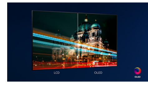
With a Philips OLED TV, you get a wider viewing angle and a uniquely lifelike picture. Blacks are deeper. Colors are truer. Details in shadows and highlights are precisely

reproduced. All major HDR formats are supported. You'll feel the full power of every scene.