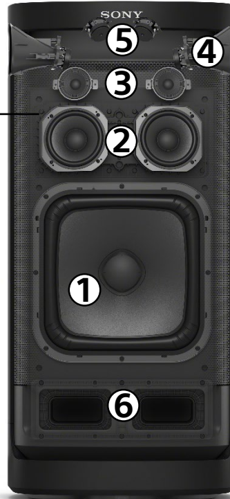
*grille is not removable (illustrative purposes only)