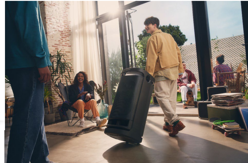
The SRS-XV900V has a handle and integrated castors- making it easy to wheel the speaker from room to room or outside onto the deck. The rechargeable battery makes set-up easy

Correct as of July 2022. price, availability and specification subject to change.