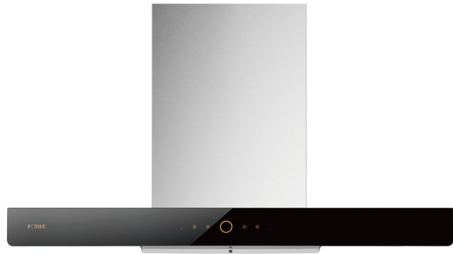
With Decorative Cover